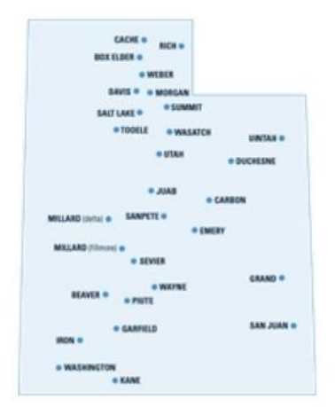
28 county offices & 4 gardens/centers