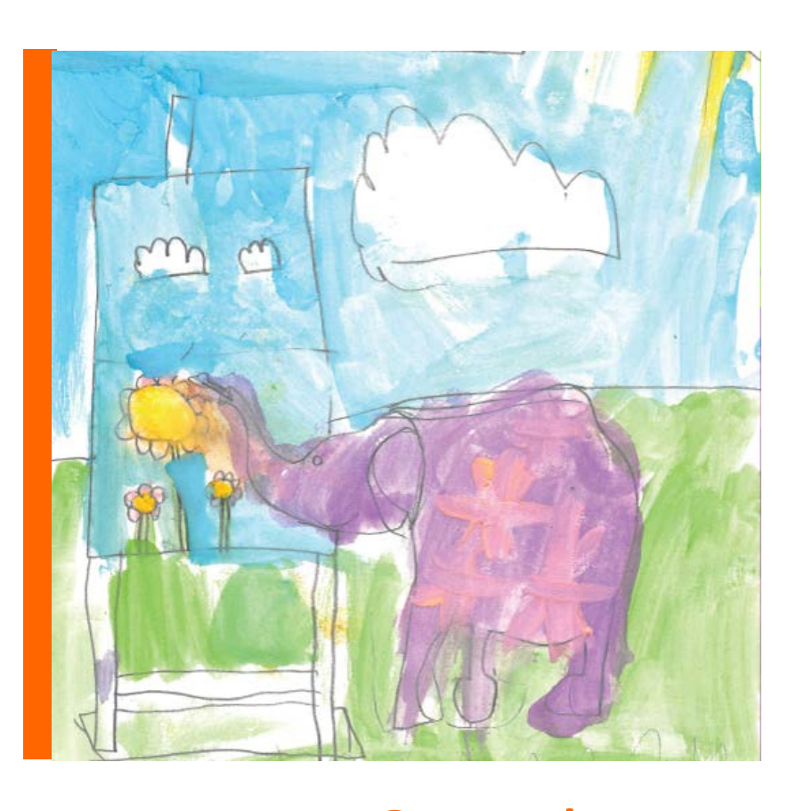
Zoo, Arts & Parks