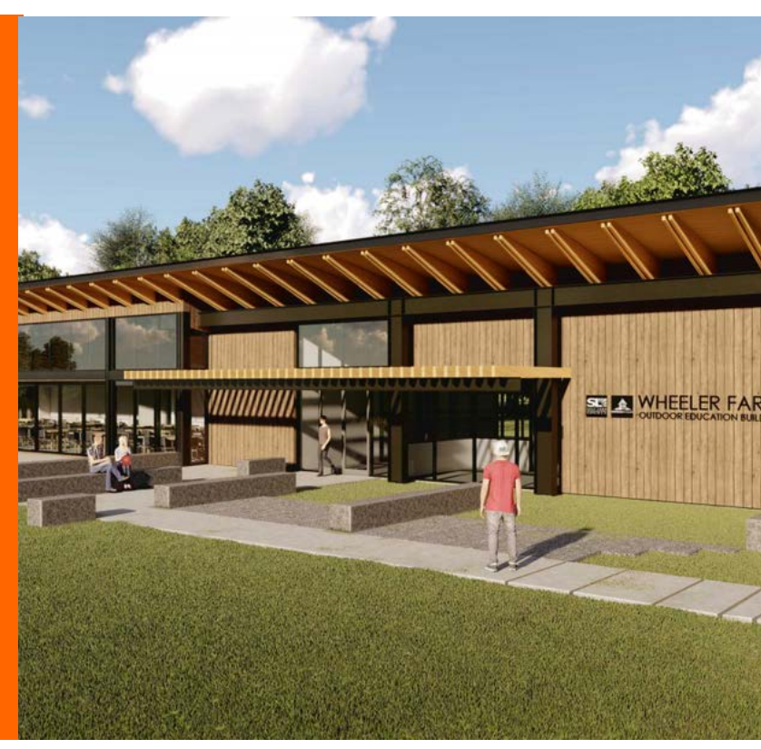
Parks & Recreation