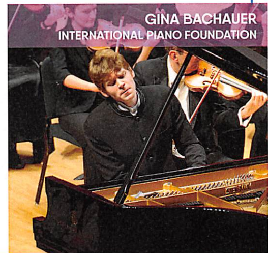
GINA BACHAUER INTERNATIONAL PIANO FOUNDATION

ZAP support has been critical to the growth of our programming... we provide opportunities for aspiring concert pianists... that help them achieve their dreams , bring world-class concert experiences to Utah audiences, and inspire 20,000 students each school year with an interactive music education program.