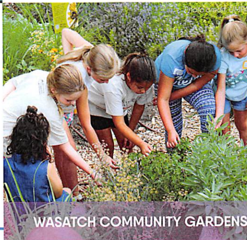
WASATCH COMMUNITY GARDENS