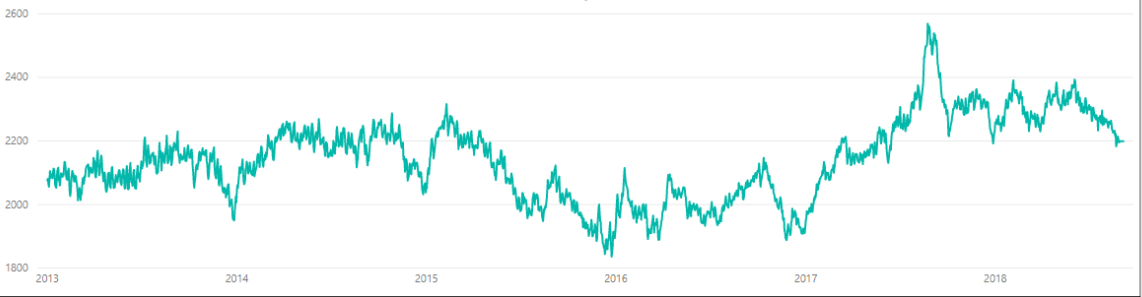
Total Jail Population