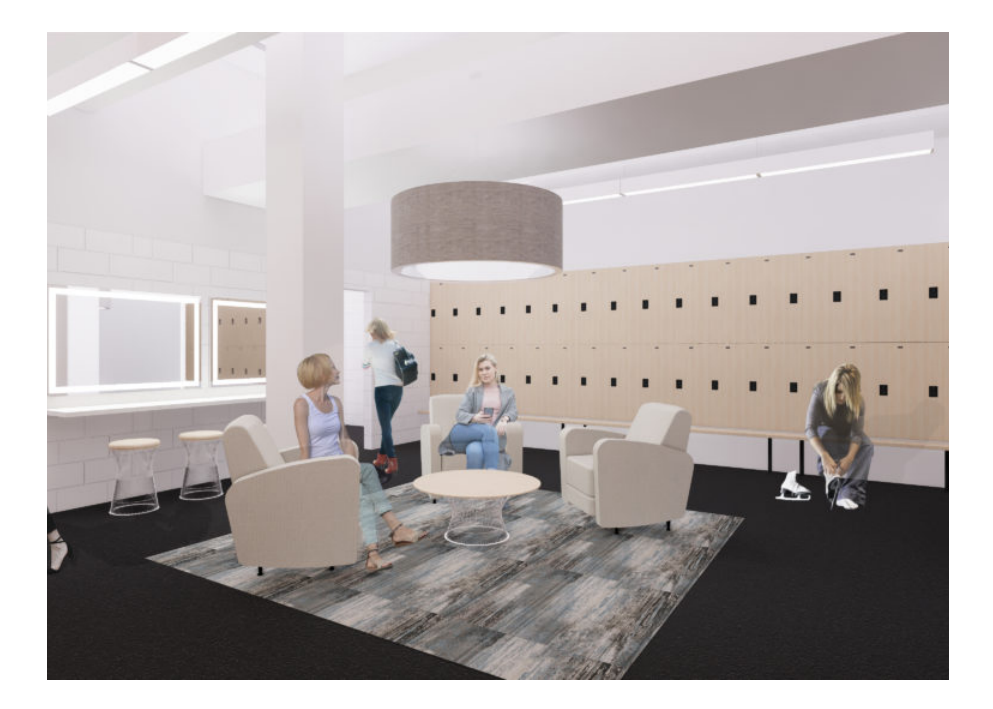
Figure Skater Dressing Room