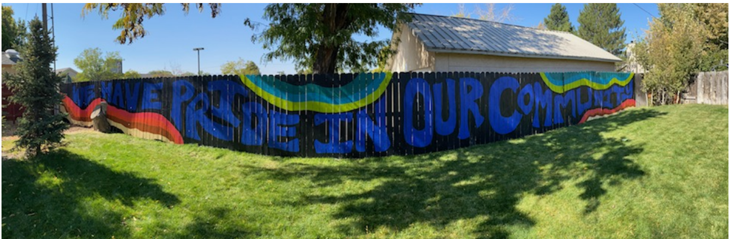
2020 Milestone house backyard fence "We Take Pride in Our Community" joint service project with the SLC Youth Advisory Board