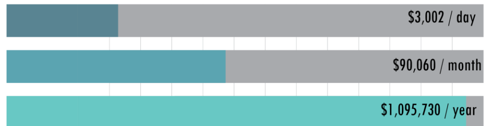
Salt Lake Nonprofit Hospital