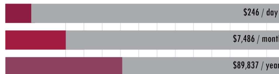
Salt Lake Valley Juvenile Detention Center