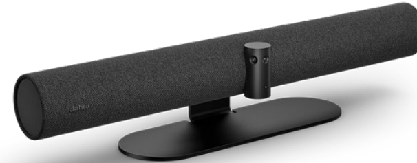
Jabra Panacast 50