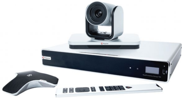
PolyCom RealPresence Group 700