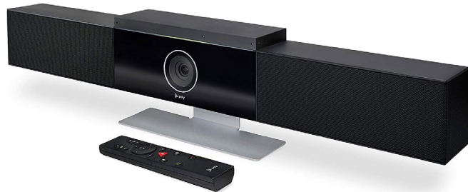
Poly Studio 4K