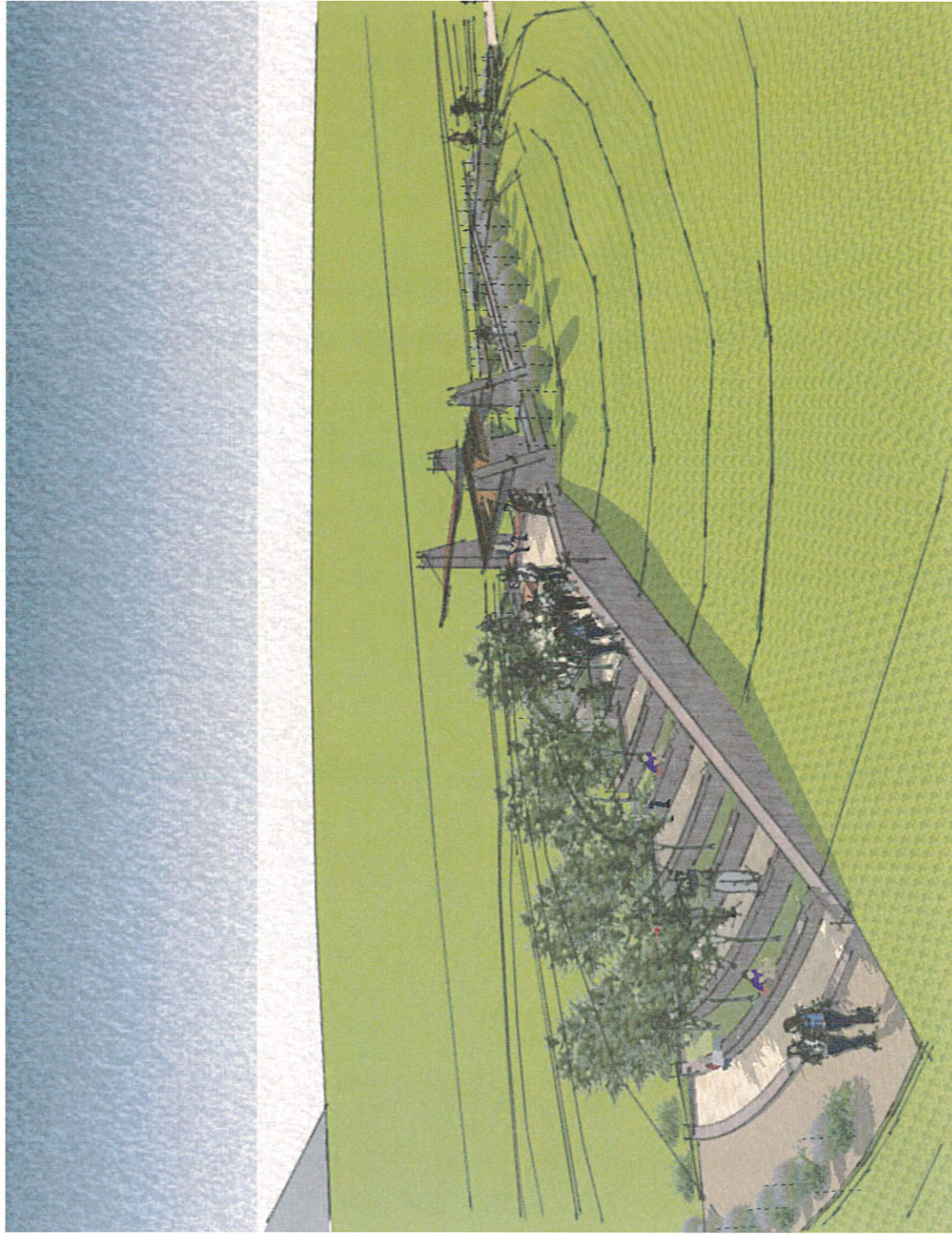
"ICON" STRUCTURE V3.1 Aerial View from Northwest