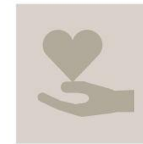
health & wellness