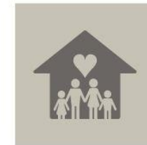
home & family