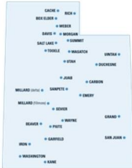
28 county offices & 4 gardens/centers