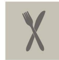
food & nutrition