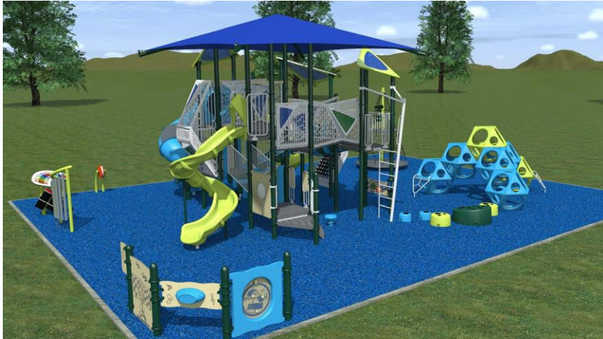
Sandy City Bicentennial Park Option 2 - Sandy City, Utah 24-14487A

Sales Representative BIG RECREATION Equipment Manufacturer PLAYWORLD The world's best and