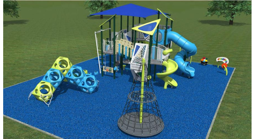
Sandy City Bicentennial Park Option 2 - Sandy City, Utah 24-14487A

Sales Representative BIG RECREATION Equipment Manufacturer PLAYWORLD The world's best and