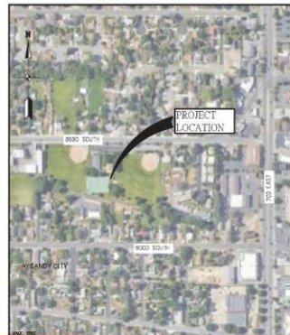
PROJECT VICINITY MAP

Note: Musco lighting plans and light spill attached at the end of this plan set.