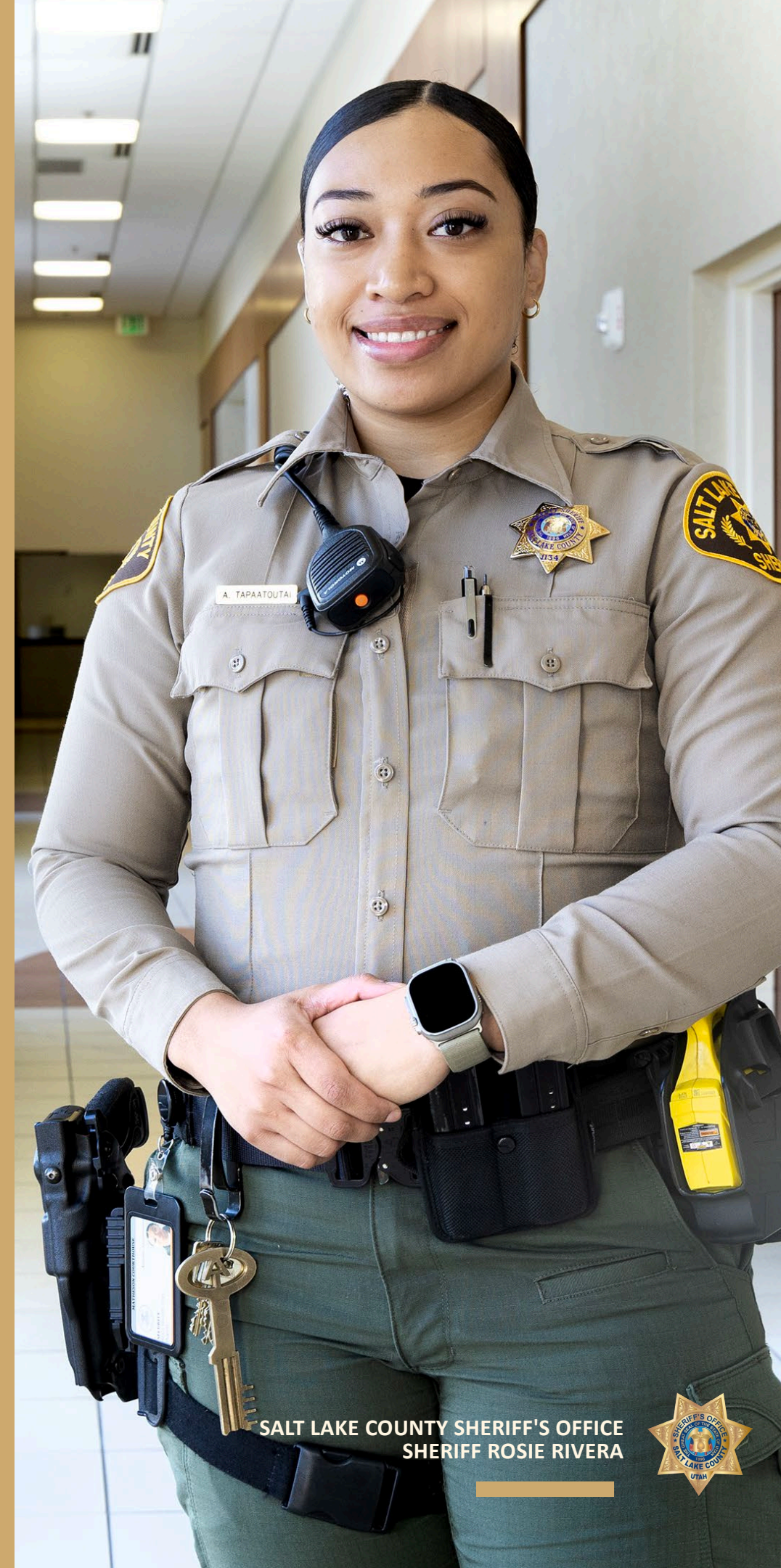
SALT LAKE COUNTY SHERIFF'S OFFICE SHERIFF ROSIE RIVERA