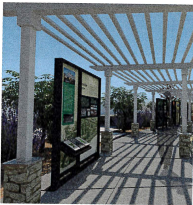
Historic Walk in City Park