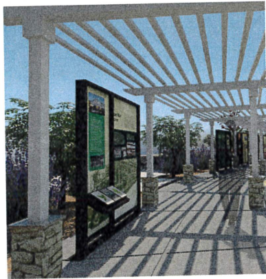
Historic Walk in City Park