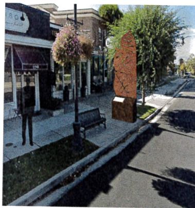
History Markers at Key Locations