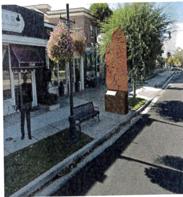
History Markers at Key Locations