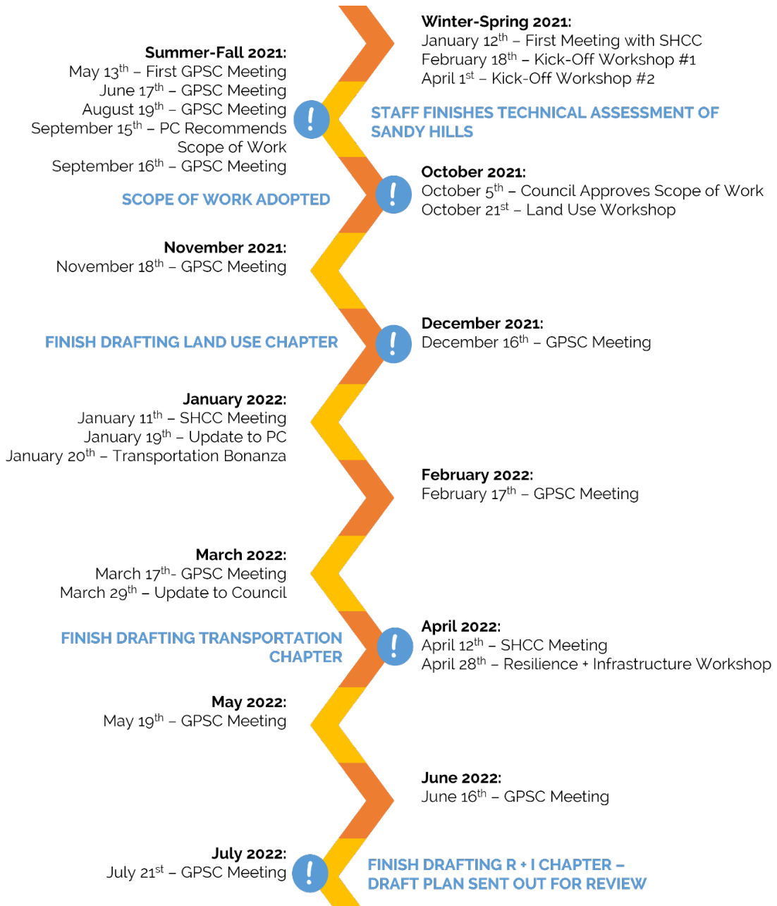
Figure 1: Sandy Hills General Plan Timeline.

Staff estimates that twenty (20) different community members engaged in the planning process, approximately one percent (1%) of Sandy Hills’ population. Those who did engage tended to attend multiple events and provide thorough feedback. Obstacles to engagement included lack of awareness of the Sandy Hills Community Council Area and lack of an online presence among residents (this was especially difficult during the height of the pandemic). On multiple occasions, flyers were mailed to residents or distributed door-to-door in an attempt to encourage more engagement.