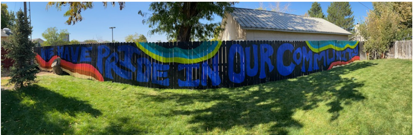
2020 Milestone house backyard fence "We Take Pride in Our Community" joint service project with the SLC Youth Advisory Board